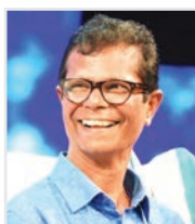
Indrans Actor Session: Nadanalla, Naatukaran