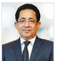
Joy Alukkas Chairperson, Joyalukkas group Session: Spreading the joy