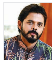
S. Sreesanth Cricketer Session: Kaliyil Malayali Akathu Puratho?