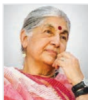
Subhashini Ali Politician Session: Reimagine India