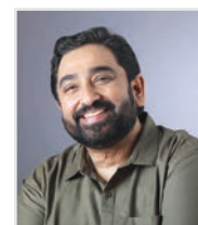
M. Jayachandran Composer, Session: Paattum Ezhuthum